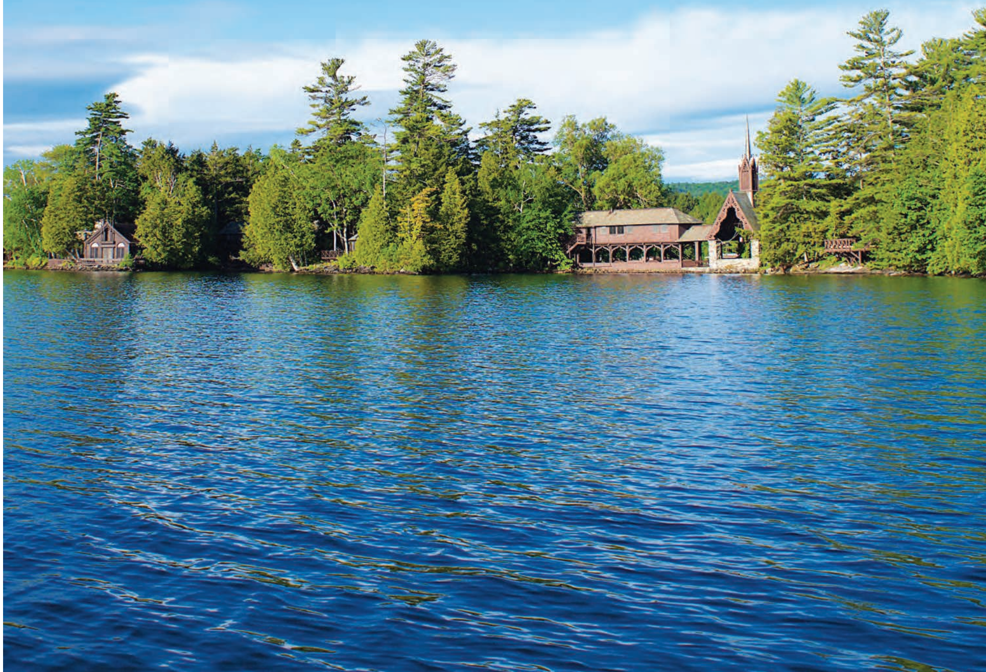
Three Brother Islands (formerly Triuna), see page 21.